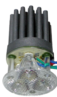
Full Color P5 II Led