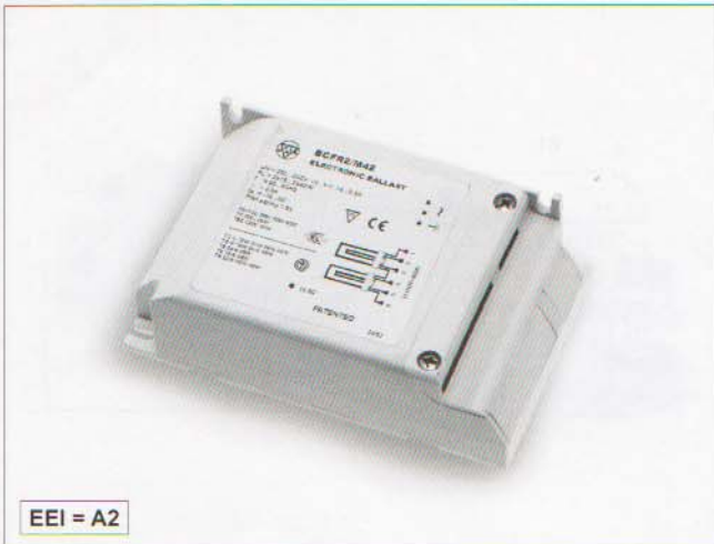
EEI = A2